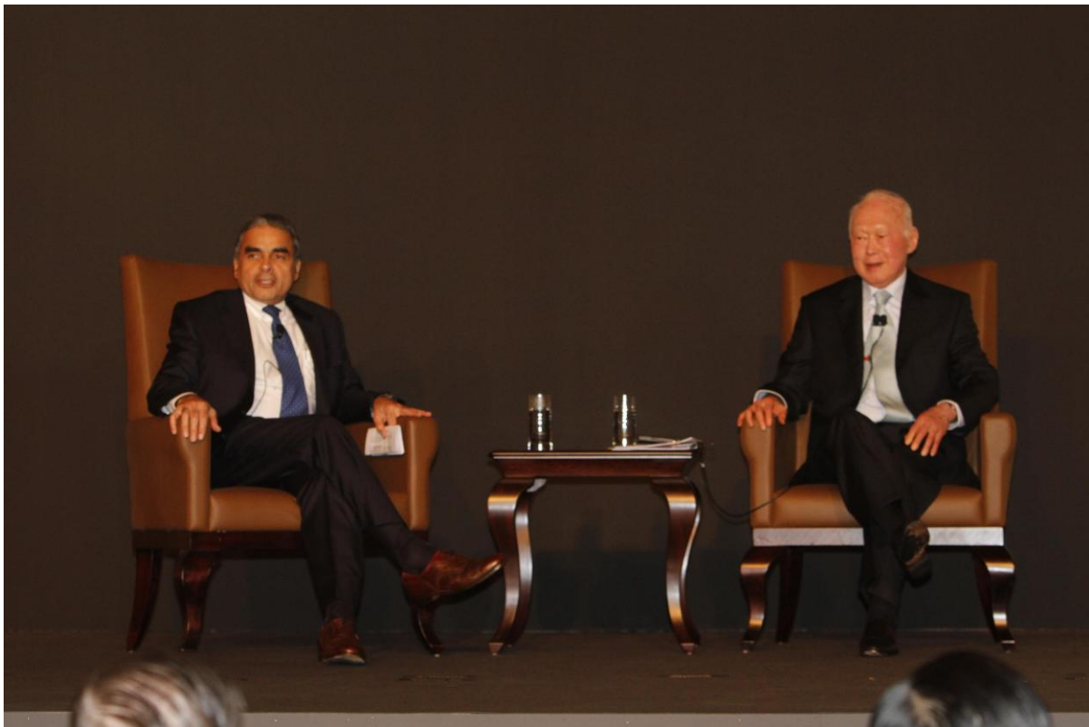
Image 1: Professor Kishore Mahbubani, Dean, Lee Kuan Yew School of Public Policy, National University of Singapore and Minister Mentor Lee Kuan Yew at the dialogue session

Singapore, June 29, 2010 – Singapore’s Minister Mentor Lee Kuan Yew presented the prestigious Lee Kuan Yew Water and World City Prizes to the 2010 laureates this evening. At the event, Minister Mentor Lee Kuan Yew also held a dialogue session with some 700 global leaders and policy makers, business leaders, industry experts and academia, who are in Singapore for the Singapore International Water Week and World Cities Summit.