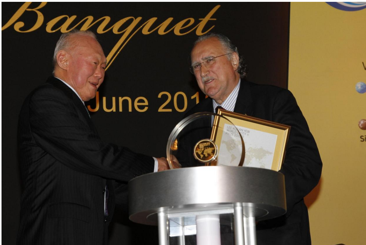
Image 4: Lee Kuan Yew World City Prize Laureate, Mayor of Bilbao, Dr Iñaki Azkuna, receiving the prize for Bilbao City Hall

The above images in high resolution are available upon request.