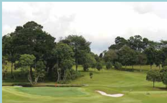
New Course, The Singapore Island Country Club