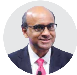
MR THARMAN SHANMUGARATNAM Deputy Prime Minister and Coordinating Minister for Economic and Social Policies, Singapore