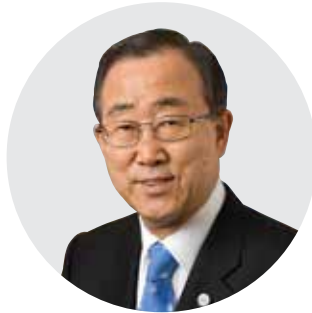
HIS EXCELLENCY BAN KI-MOON 8th Secretary-General, United Nations